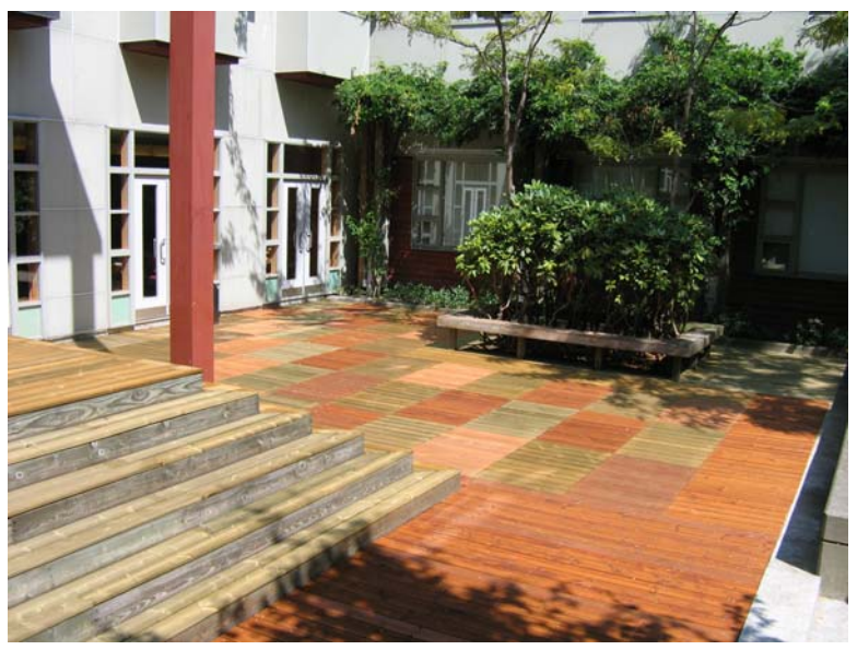
Figure 2 FPInnovations courtyard deck

The boards were rated using a draft AWPA standard for serviceability of decking, developed by FPInnovations, for the following dimensional stability characteristics. Cupping, and length, depth and width of checks were measured individually for each sample on the top face, as follows: